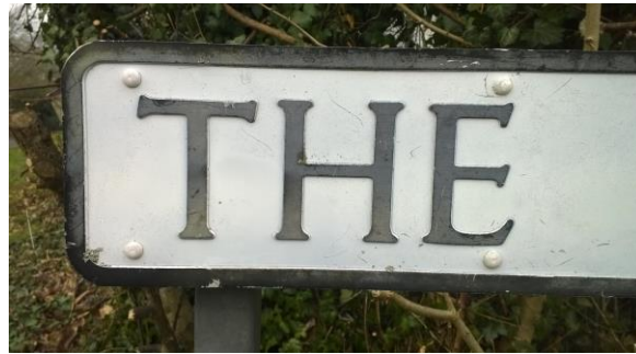
Font to be used

The design of the new signs incorporates the Parish logo. The font is as shown in the photo below *font example". This conforms to the font of most street signs in the area.