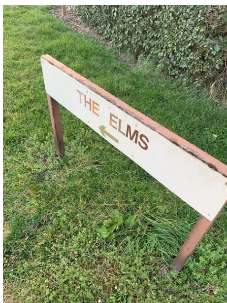
Existing street signs at The Elms